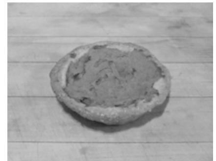
A Tasty Medlar Tart