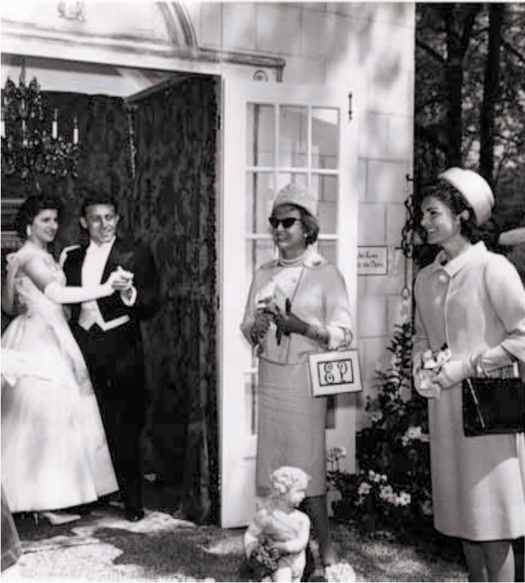
Jackie viewing a Flower Mart display titled “An Evening in Vienna” 1961.