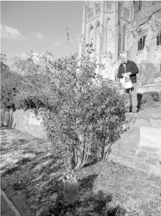
On the Wall—Bishop's Garden Harvesting the medlar in December Insert—picked fruit

The medlar in the Bishop's Garden spends the winter leafless and bleak. In summer, the tree hides behind bright perennials; people stroll past it in search of more glorious sights. Even so, the medlar is remarkable, not only because of its presence in poetry as far back as Chaucer, but also because it helps us understand how the past tasted.