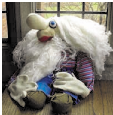
Meet Rumpy at Flower Mart