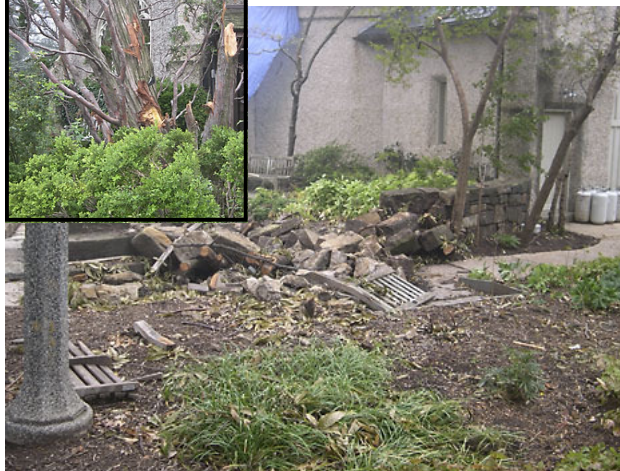
Garden and trees outside Herb Cottage now ravaged.