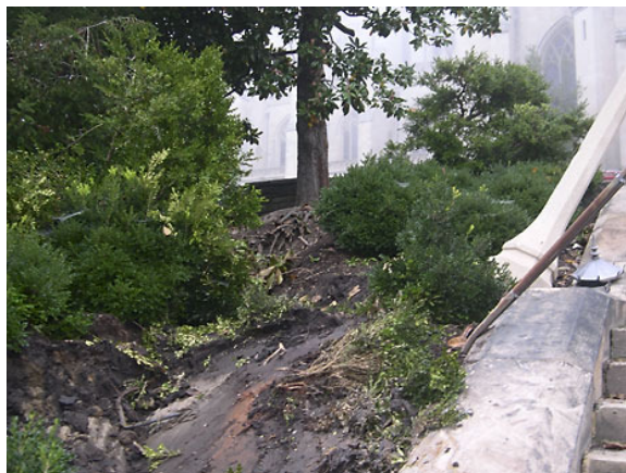
Destroyed boxwood at top of Pilgrim Steps

Photos Show the Devastation. More photos may be seen at— www.allhallowsguild.org/crane